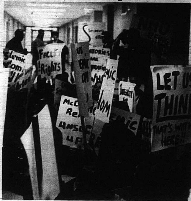
As part of their protest, several students had a "sit down" in front of the president's office in the University Center.